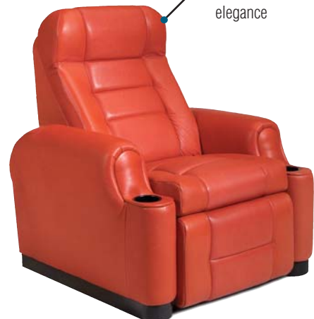
MONACO Classic elegance