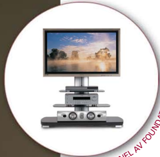
FLAT PANEL AV FOUNDATIONS