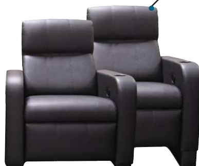
Fortress Seating's Motorized Adjustable Seat Height

Fortress, based in Rancho Cucamonga, California, understands that in the home theater market, no two clients are alike. In this special business, the entertainment experience will be either enhanced by the correct seating or compromised by selecting the wrong seating. Fortress steps in as a trusted merchandise supplier. Though it offers numerous designs and specialty accessories, its ability to create something exclusive, in the highly custom area of home theaters is where the company excels. New products for this year from Fortress include Motorized