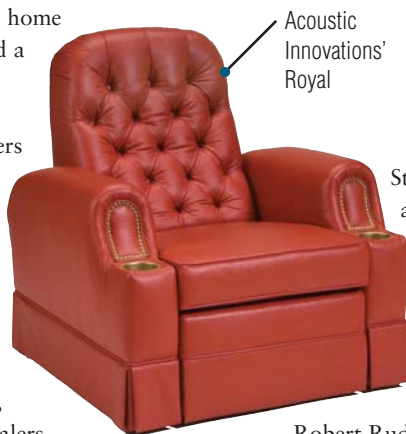
Acoustic Innovations' Royal

But can you have optimized viewing, solid support, and the cushy comfort of sofa? Acoustic Innovations says yes. The Boca Raton, Florida manufacturer is best known as a manufacturer of home theater seating and it is also a designer and installer, too. In fact, it has its own