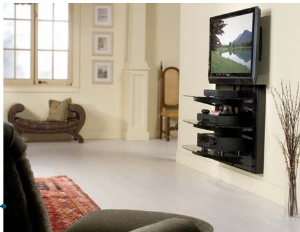
Sanus Systems' VF5023

Bell'O International is another manufacturer respected for its attention to detail and product range. "[We] offer the broadest selection of Italian designed home theater furniture,