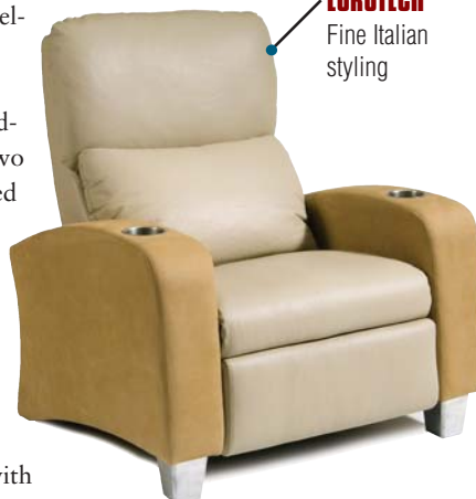
EUROTECH Fine Italian styling

Visit www.acousticinnovations.com or call 800-983-6233.