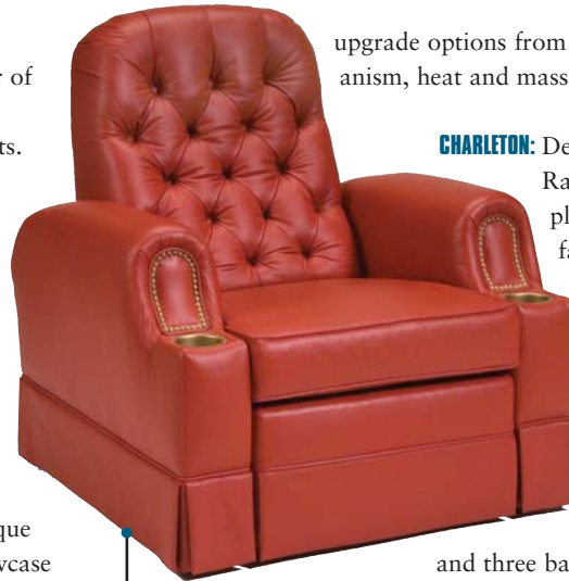
ROYAL The ultimate in utility and convenience

ROYAL MODEL: An addition to its successful CinemaChair line, the Royal design extends AI's CinemaChair line-up to ten different recliner models. The Royal CinemaChair is available in a variety of fabric, suede, velvet, and leather grades and colors. Combinations allow individual or grouped seats, loveseats or sofas, providing the ultimate in seating flexibility. Two sizes of wedge-shaped arms allow curved seating applications with different radii. Two styles of consoles, both available in two widths, one incorporating a rollout storage bin, the other customized to fit a control panel, allow for ultimate utility and convenience. The Royal model, as well as all CinemaChair models, can be ordered with